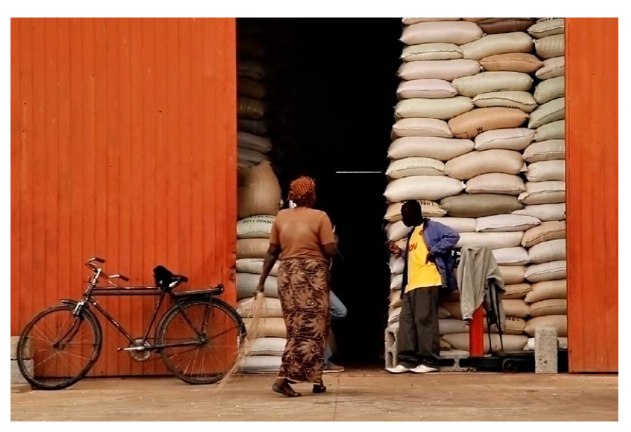
Zambia grain store: agriculture in Sub-Saharan Africa is growing and continues to receive political attention but the challenges to achieving food security and sustainable rural livelihoods persist. GLOBAL DEVELOPMENT NETWORK